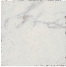
Carrara AP2071 • T165