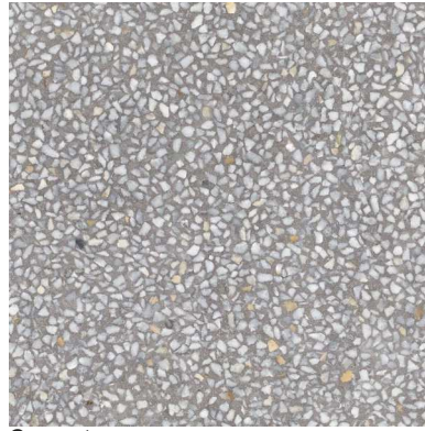
Cemento VP6002 ■ T078