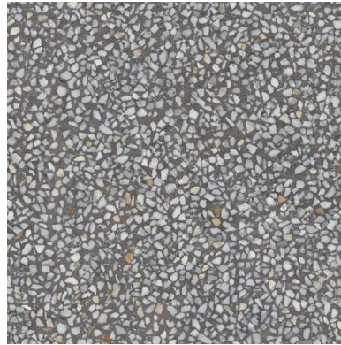
Grafito VP6004 ■ T078