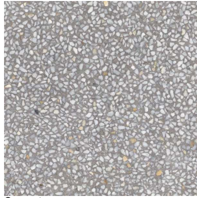
Cemento VP6002 ■ T078