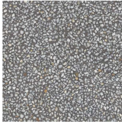
Grafito VP6004 ■ T078