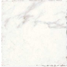
Carrara AP2071 • T165